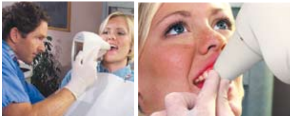
The cordless, handheld ShadeVision instrument includes a touch screen display for unique "line of sight" viewing and proper positioning.

The most detailed and comprehensive color matching system available, and the only to receive REALITY's 5-Star rating , ShadeVision takes out all of the guesswork.